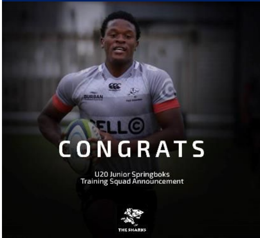
Pepis is selected for Junior Springbok Squad!