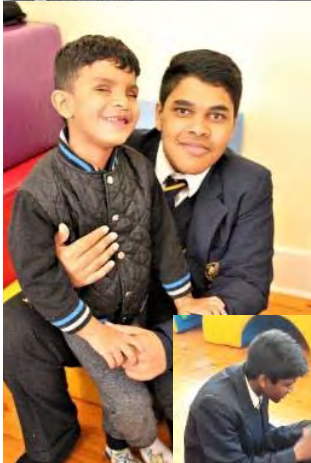
The DHS Boys spending some quality time with the children at Bright Eyes