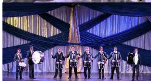
DHS placed 3 rd