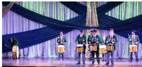
Glenwood placed 2 nd in the Drumline Competition