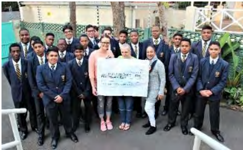
The Community Service Electives group present the R5000 cheque to Bright Eyes