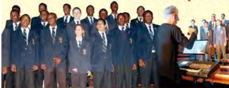
HOSTED BY: OUR VERY OWN DHS SINGERS & DANCERS

17 TH AUGUST | 17h30 FOR 18h00 @ D.C. Thompson Hall (DHS)