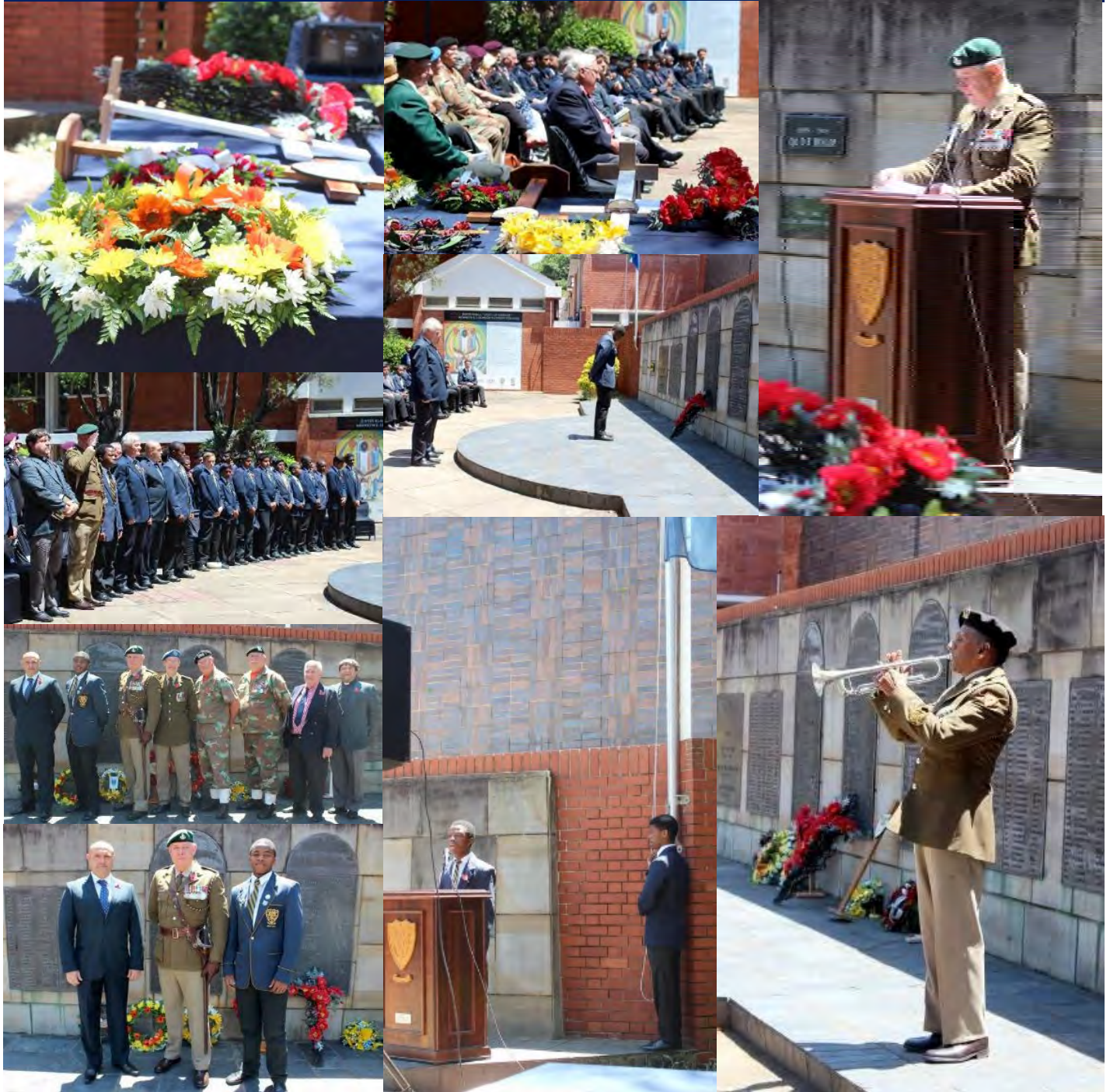
DHS Remembrance Day Service