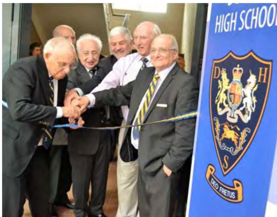
The Trustees of The Victor Daitz Foundation cut the ribbon at the entrance to the Mathematics & Science Centre