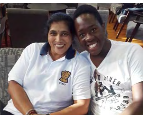
A surprise visit from an Old Boy!