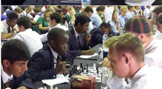
The DHS Chess team which toured to Grey College, Bloemfontein