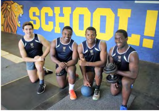
The new mural on the wall at the DMG looks really good! Thanks to DHS Old Boy, Dusted Ink.