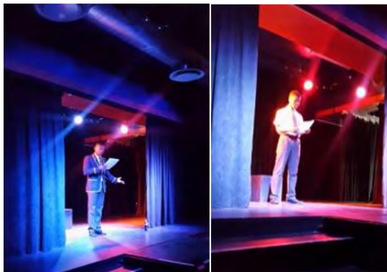
Poetry Club Open MIC