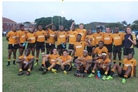
The 1 st XV Rugby team after their win vs Port Natal at the Trevor Bennison Rugby Day