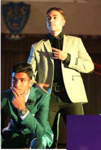
Our Matric Boy and Staff strutting their stuff at the Matric Fashion Show!