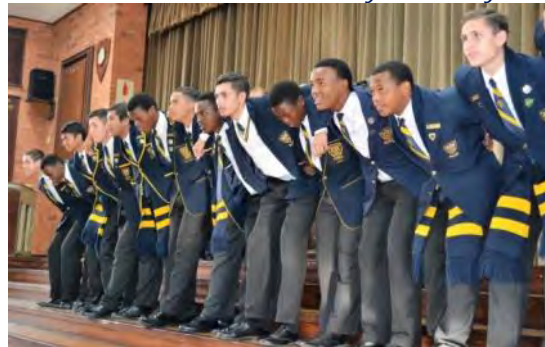
The Prefects perform the War Cry with the Old Boys at the Assembly