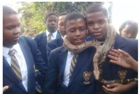
Grade 9s learning about snakes at Phansi!