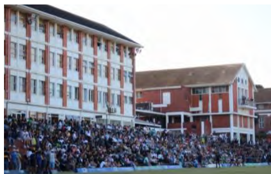
Founders Day ... rugby, war cries and crowds ...it was another great celebration day!