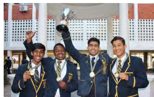
Defending SA Badminton Champs!

Good luck, Gentlemen! We wish you all the best for the Championships, and particularly with defending your SA Champs title.