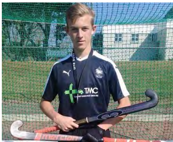
Hockey Star, Tiagan Terreblanche