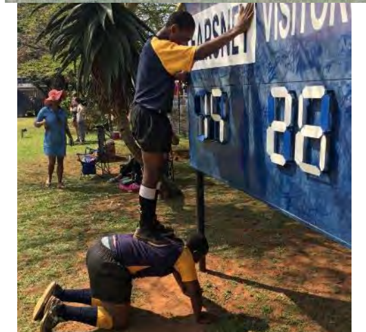
Teamwork at the DHS Tournament!