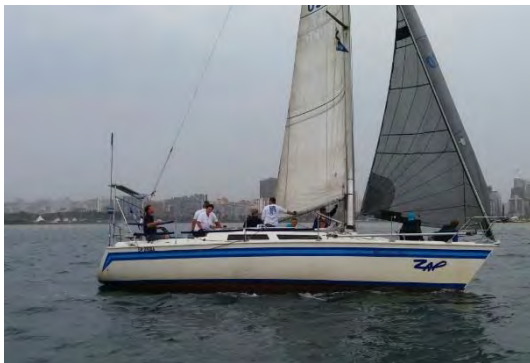
DHS Sailing Club participated in the annual heritage Regatta at the Royal Natal Yacht Club