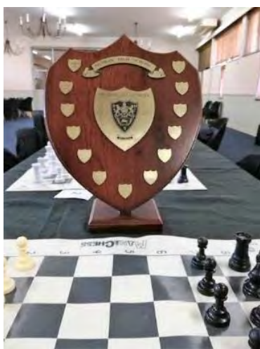
Rapid Chess Cup