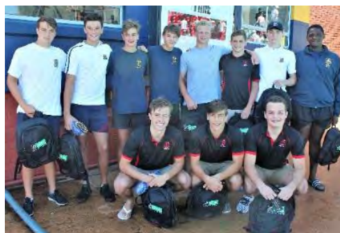
The Tournament Team