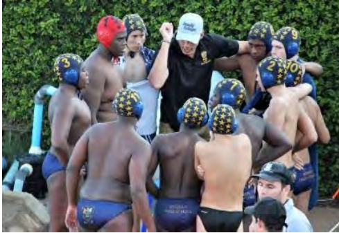
The DHS U16/U15 Team