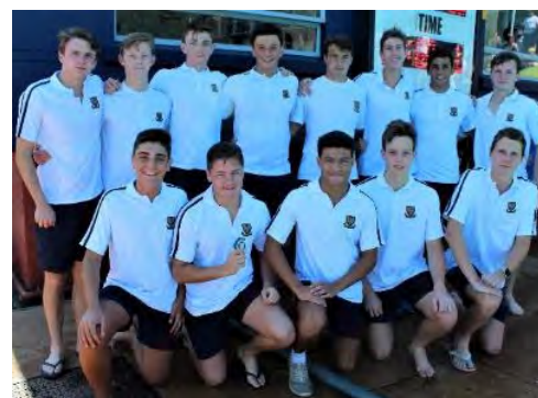
2 nd Place - St John's