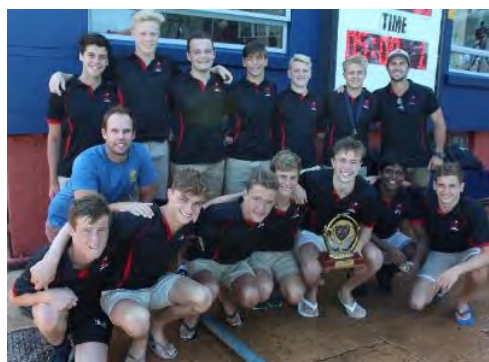
Tournament Winners ... Clifton