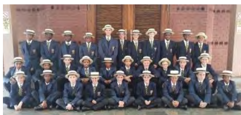
The Grade 8 Award Winners in their brand new bashes