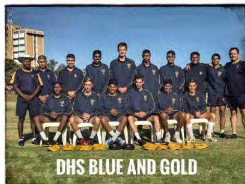
The 1 st XI Cricket Team at the Grey High Cricket Festival