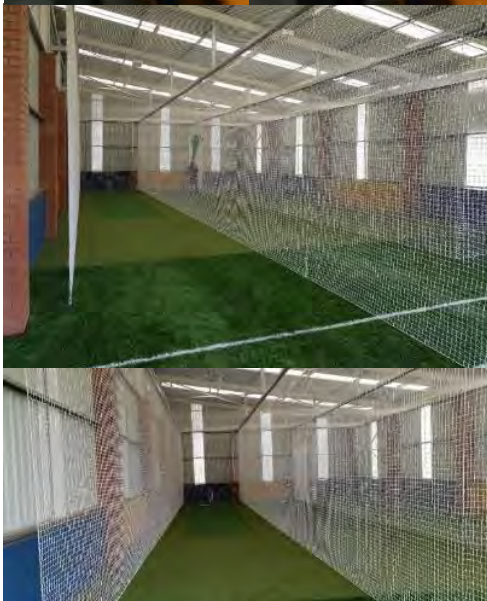
Nischay Jairaj placed 2 nd with a 91% average