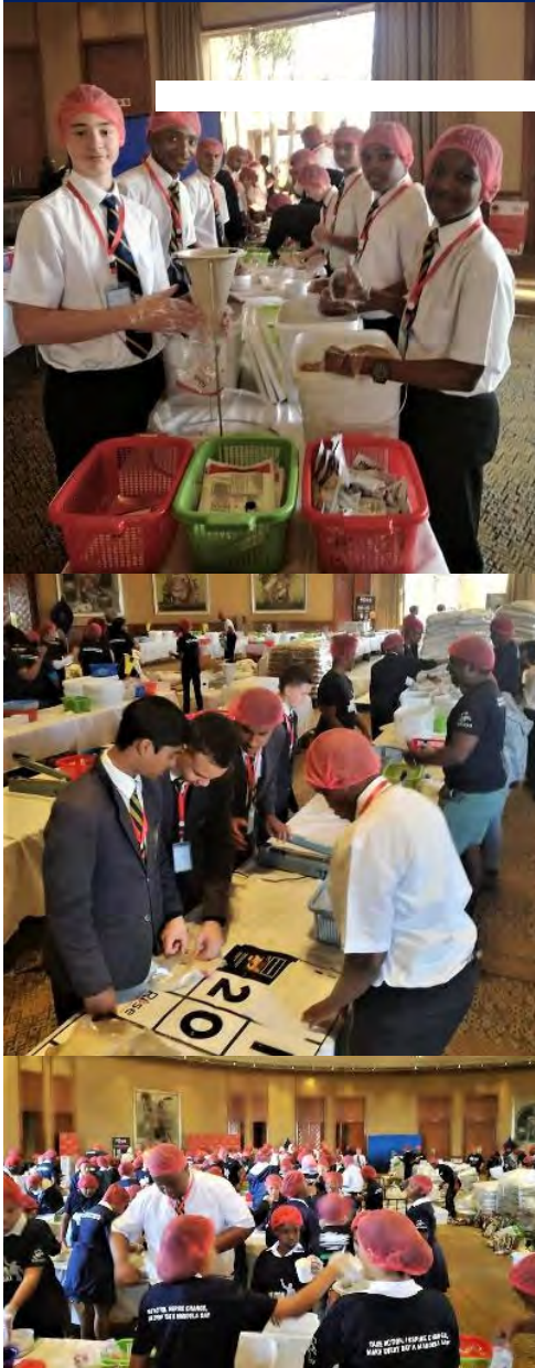
Meal Packing for Rise Against Hunger in honour of Nelson Mandela