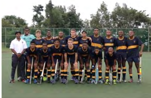
U16A Hockey @ Keith Fairweather Festival