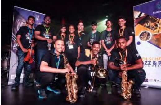
KZN Jazz Band Achievers!