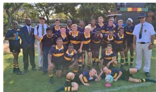
U14A Rugby @ Glenwood Festival

Watch the Kearsney Easter Rugby Festival on YouTube with SuperSport Schools