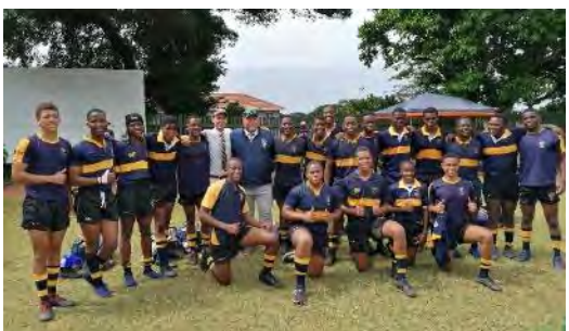
U16A Rugby @ Glenwood Festival