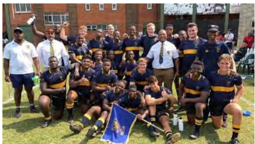
2 nd XV Rugby @ Glenwood Festival