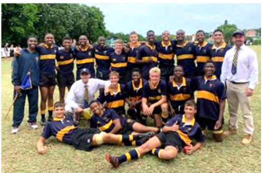
U15A Rugby @ Glenwood Festival