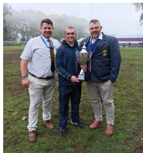
DHS 1 st XV, the most attractive team at the Kearsney Easter Rugby Festival