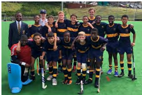
U14A Hockey Team