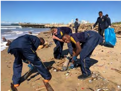
Grade 9R assisting with a Beach Clean Up