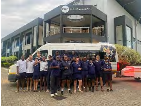
BE Boys assisting with Community Service