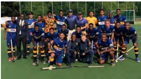
DHS Hockey Boys