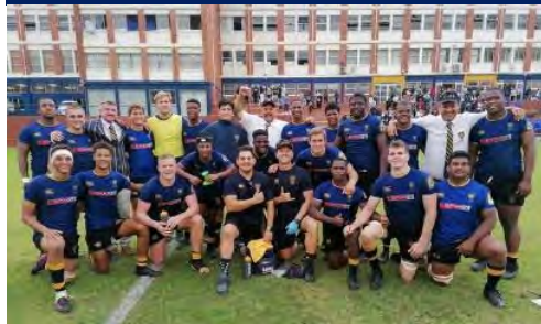
1 st Team Rugby vs Michaelhouse