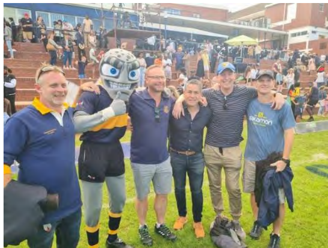
DHS Old Boys @ the Hilton game with our Horsefly

We look forward to our birthday celebrations and an exciting day on Saturday.