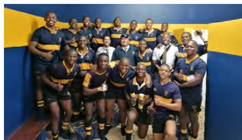
U1A Rugby vs Hilton