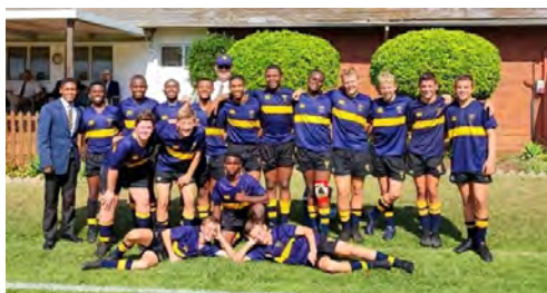
U14A Rugby vs Hilton