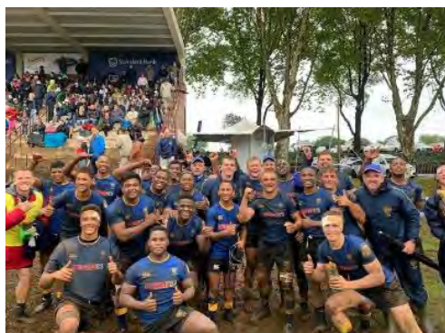
1 st XV vs EG Jansen @ Kearsney Festival