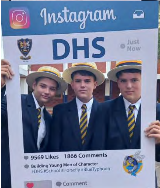
Grade 8s on their First Day @ DHS