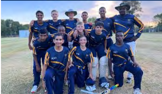
U15A Cricket Team