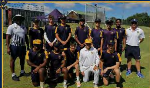
DHS 1st XI Cricket Team