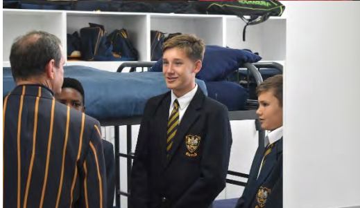
Opening of Grade 8 SAS Nourse Dormitory